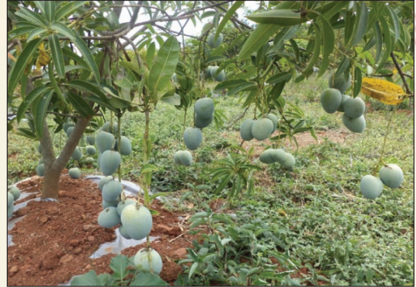
WADI mango in field before harvest