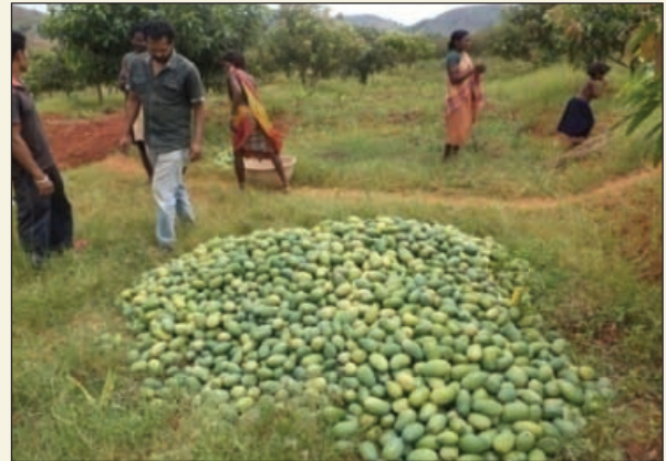
Aggregation of Mango