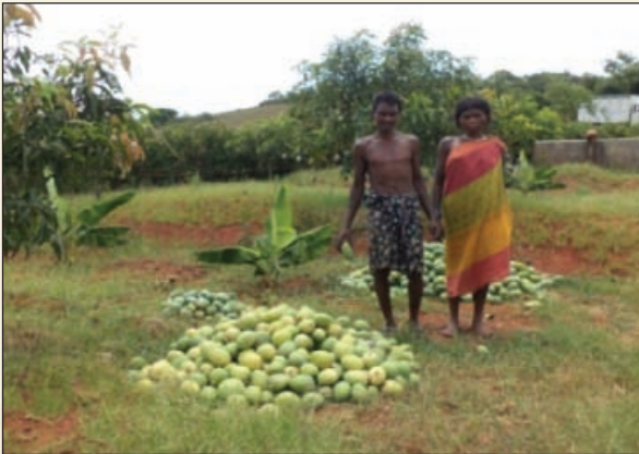
Harvesting by owner themselves