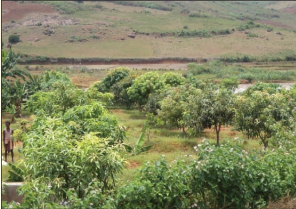
WADI field of Natha Sounta, Khajuriput

During first year of intervention of OTELP by FNGO CYSD in Dasamantapur Block it was decided to promote WADI model of mango orchard which was successful model in Moharastra. The programme was implemented during 2009 with the involvement of 39 Tribal house hold of Dasamantapur block in an area about 123 ac.